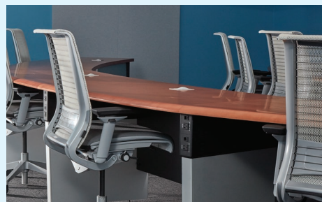
Office Facilities Cold and flu impact where you work.