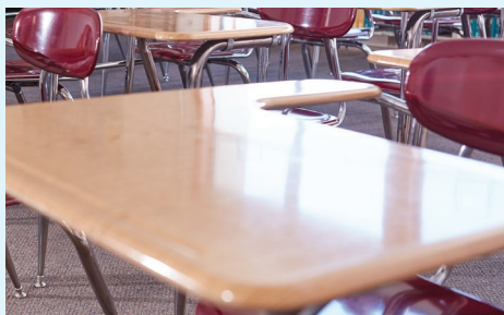
Classrooms Cold and flu impact where you learn.