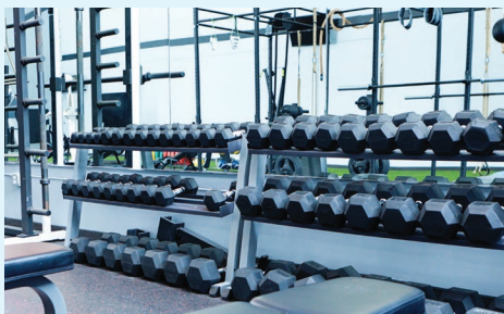
Athletic Facilities Cold and flu impact where you train.

18 — number of norovirus particles required to infect a student or employee with norovirus. 6